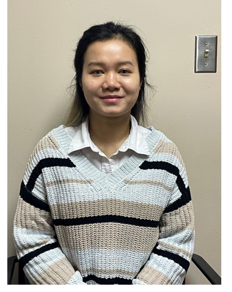
Da Meh Support Services Warren