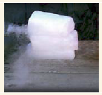
Dry ice should be used during transport to maintain vaccines in their frozen states.

• Written protocol for appropriately storing vaccine at the alternate vaccine storage facility. Combined measles, mumps, rubella, and varicella vaccine (MMRV); varicella vaccine; and zoster vaccine should be stored in the freezer at 5°F (-15°C) or colder. Other vaccines should be stored in the refrigerator at 35° to 46°F (2° to 8°C). There should be adequate cold air circulation around the vaccines. Each alternate vaccine storage unit should have a functioning certified calibrated thermometer in each compartment.