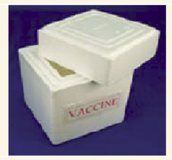
Use properly insulated containers to transport vaccine.