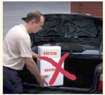
When transporting vaccine in ordinary vehicles use the passenger compartment—not the trunk.

• If the location is far away or if you have a large quantity of vaccine, consider renting a refrigerated truck to transport the vaccine. In this case, joining with other practices to reduce costs may be advantageous if a refrigerated truck rental is necessary. Make advance arrangements with a local refrigeration company and an alternate and record the contact information in the <u>Emergency Vaccine Retrieval and Storage</u> Plan Worksheet.