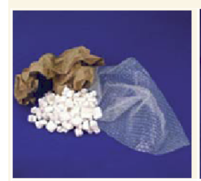
Place bubble wrap, crumpled brown packing paper, or Styrofoam™ peanuts between the refrigerated/frozen packs and the vaccines.