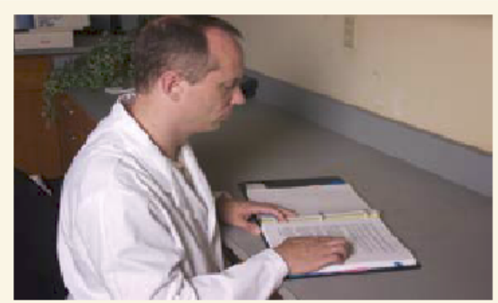
Develop and adhere to a Routine Vaccine Storage and Handling Plan.

All healthcare providers who administer vaccines should evaluate their cold chain procedures to ensure that vaccine storage and handling guidelines are being followed. Each office should develop and adhere to a detailed written Routine Vaccine Storage and Handling Plan. This plan should include all aspects of routine vaccine management, from ordering vaccines and controlling inventory to storing vaccines and monitoring storage conditions. A written plan will help vaccine providers stay organized and will provide quality assurance of proper vaccine management.